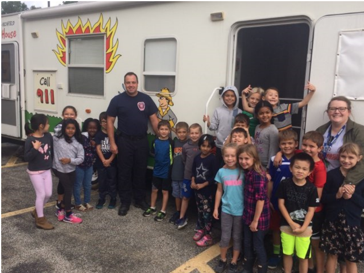
Firemedic Urban with Safety Trailer, at Hillcrest Elementary