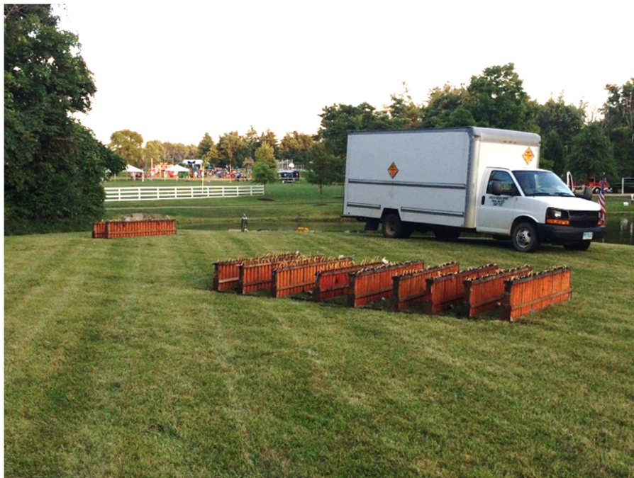
Community Day Fireworks