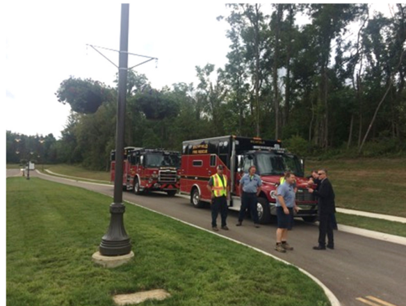
Kinross Lake Parkway Extension Ribbon Cutting Ceremony