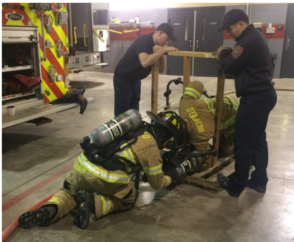
Self-Rescue thru a 16" wide wall space.