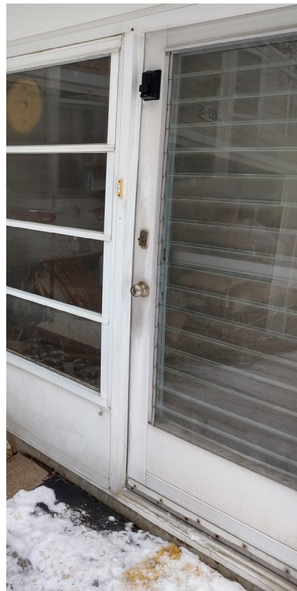
Residential Lock Box