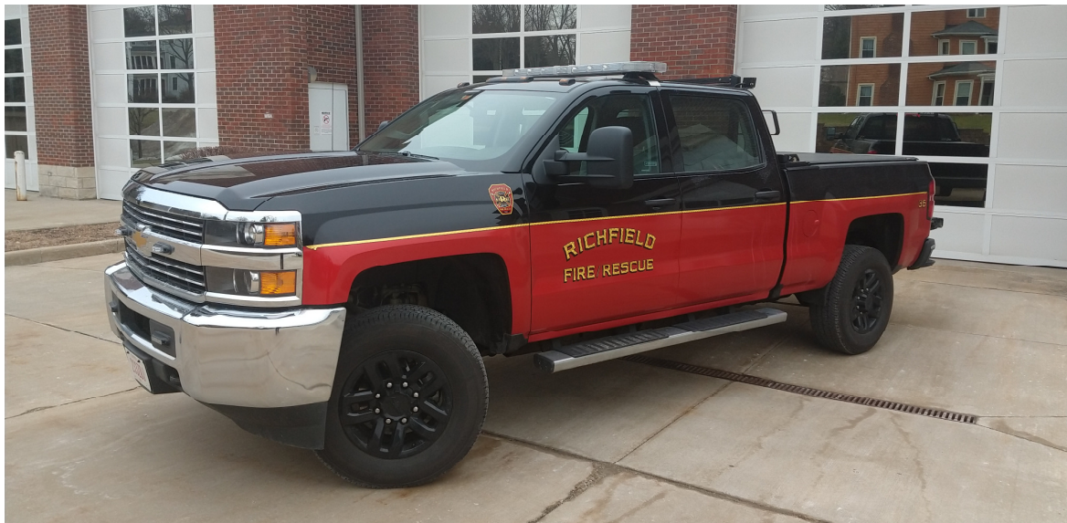
Car 36, Utility Vehicle

The fire station itself is now 15 years old and has needed some service. Ongoing projects include: kitchen remodel, painting, garage door safety updates, training room updates. The department is looking forward to meeting the ever changing and increased demands on its equipment and members. Through the use of committees, made of the members, we are developing guidelines for all future purchases.