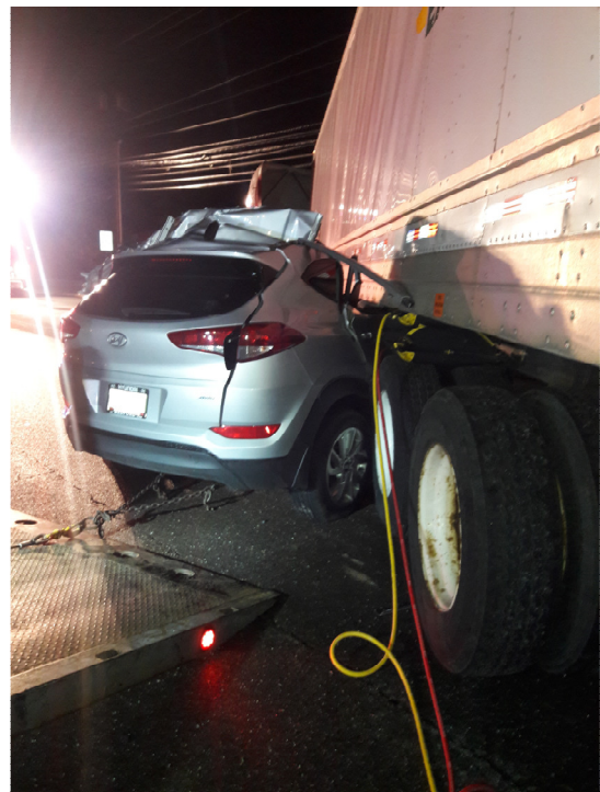
Air Bag use to lift Trailer off vehicle