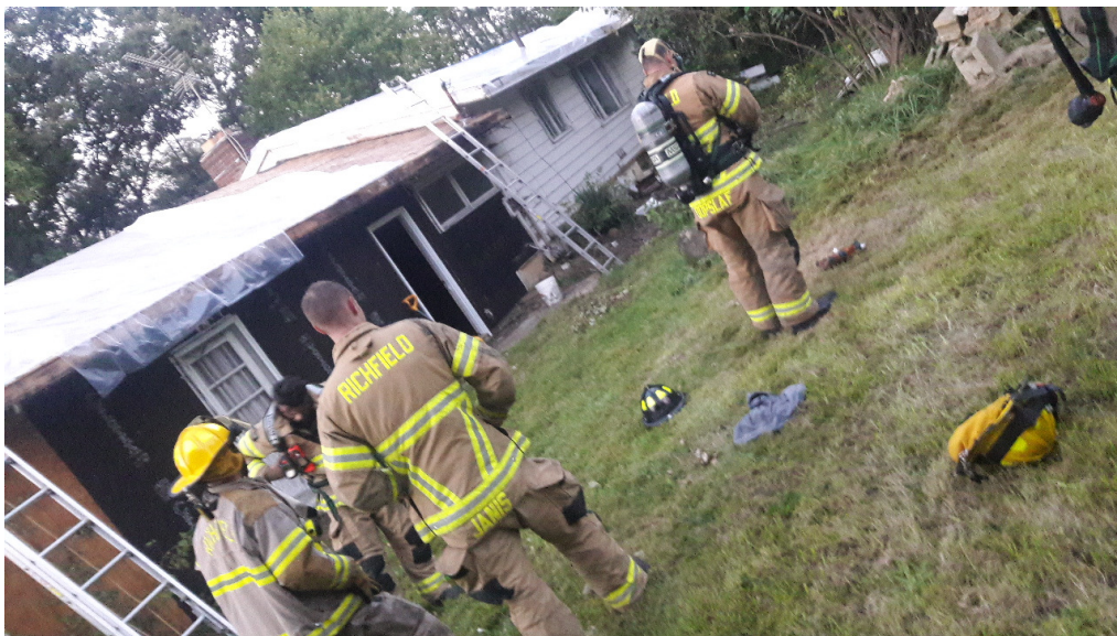
Wheatley Road Roof Ventilation Training