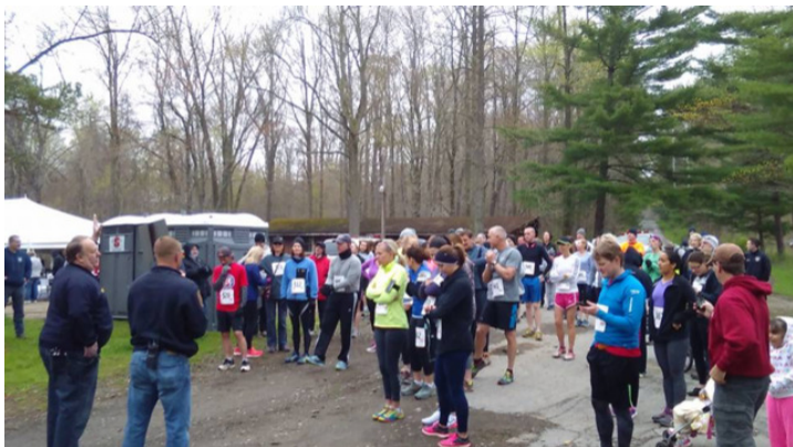
Richfield Firefighters 5K Trail Run/1-Mile Walk