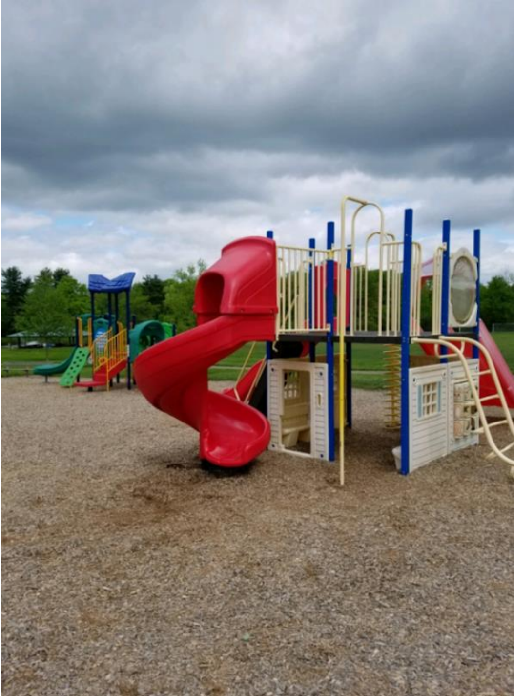
Replacement Playground at Richfield Woods