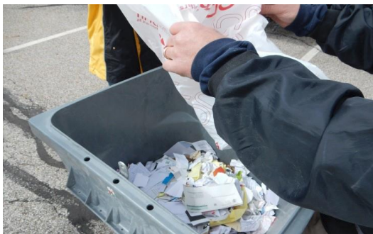
Shredding service for residents at Project Pride

Recycling of paper and electronics is held behind Town Hall along with street cleanups by family and students. The department partners with Revere Local Schools.