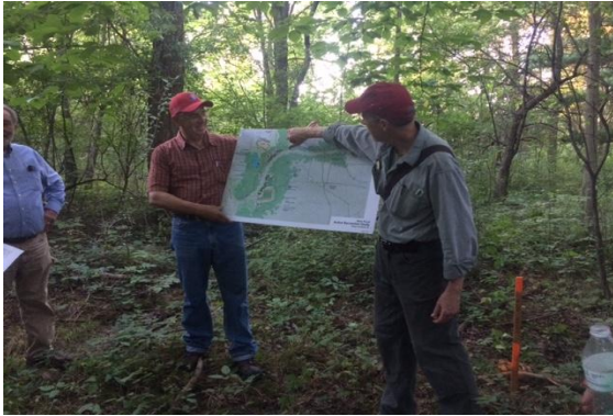
WALKING THE PEDIGO PROPERTY TO PLAN FOR THE FUTURE ROAD