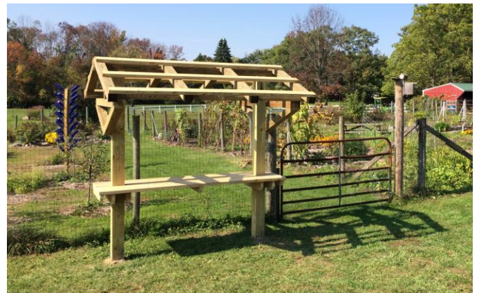
This project is awaiting a green metal roof.