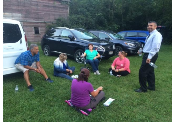
PARK BOARD HAVING A PLANNING MEETING ON THE FUTURE ROAD