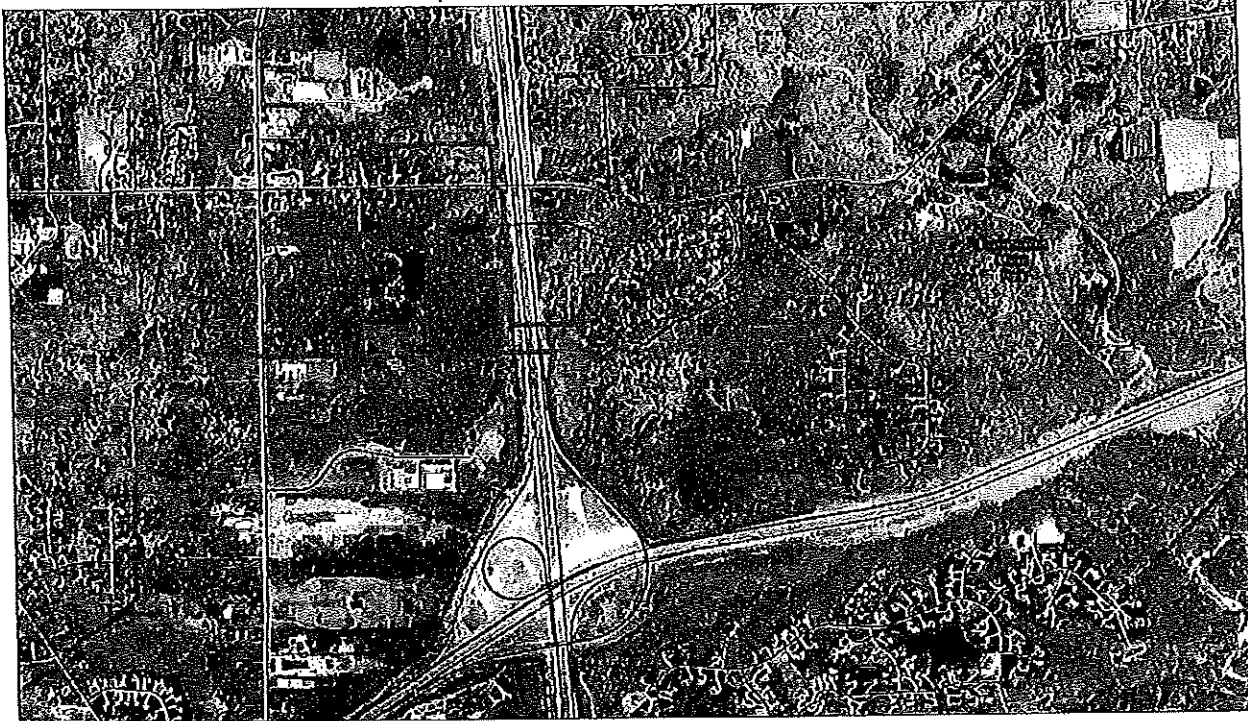
Proposed TIF District - 297.5 acres